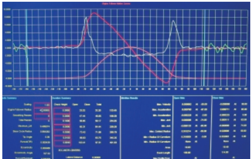
Accu-Cam™ Precision Profile Measurement & Accuracy Standards