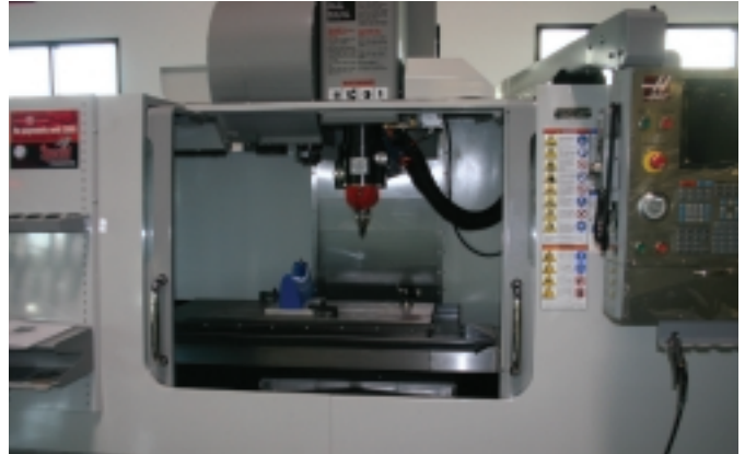
Specially Equipped 1 Micron Precision CNC Master - Cam Generator