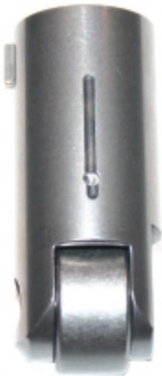
Hi-Tech EZ-Roll™ Keyway Roller Lifters!